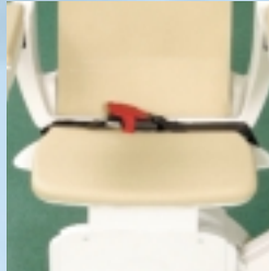
Aircraft style quick release belt.

A variety of seatbelt options are available to best suit your individual requirements