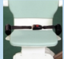
Reel style belts.