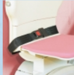
Car style button belt.