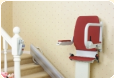
Stairlift will operate using the main lift controller or the remote handset