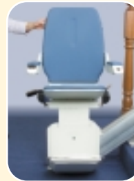
Powered seat & footrest raiser option simply folds away stairlift at the touch of a button