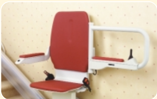
Stairlift will not operate