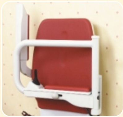
Stairlift will only operate from the handset