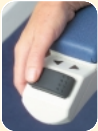
Standard rocker control for easy operation