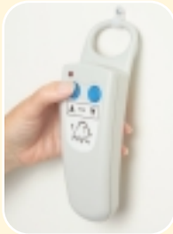
Wireless hand or wall mounted remote control