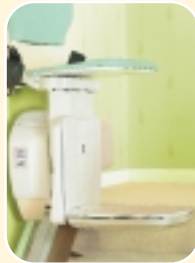
Footrest stops level with top stair for easy and safe access to the landing